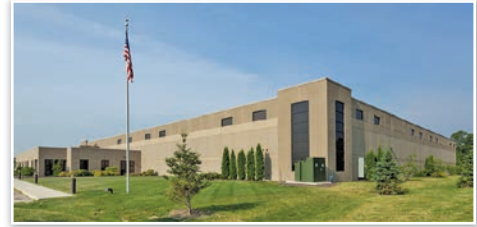
Headquarters in Germantown, Wisconsin

Founded in 1974 as LMP Fasteners, WorldSource has decades of expertise in the validation, procurement, and application of Industrial and Commercial Fasteners. Our legacy continues today as WorldSource Fasteners®, your local, full service, stocking Fastener Specialists. Throughout the years our focus has been to offer the best service, local inventory, technical expertise and professionalism possible. We are dedicated to searching the world over in an effort to create the best value available in the Industrial and Commercial Fastener industry. Whether a standard off-the-shelf solution, or a highly engineered custom solution, we will find what you need to hold anything securely.